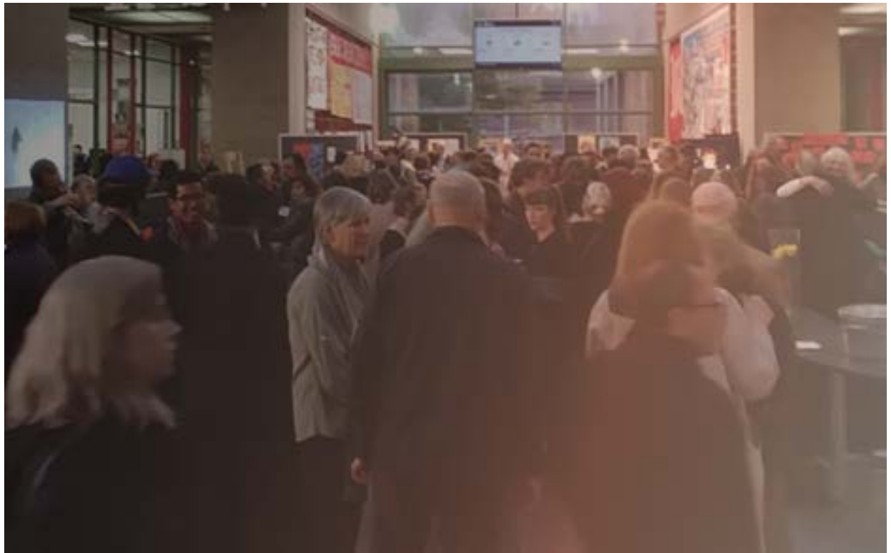
2018 Oral History Conference - Concordia University, Montréal, Oct. 2018