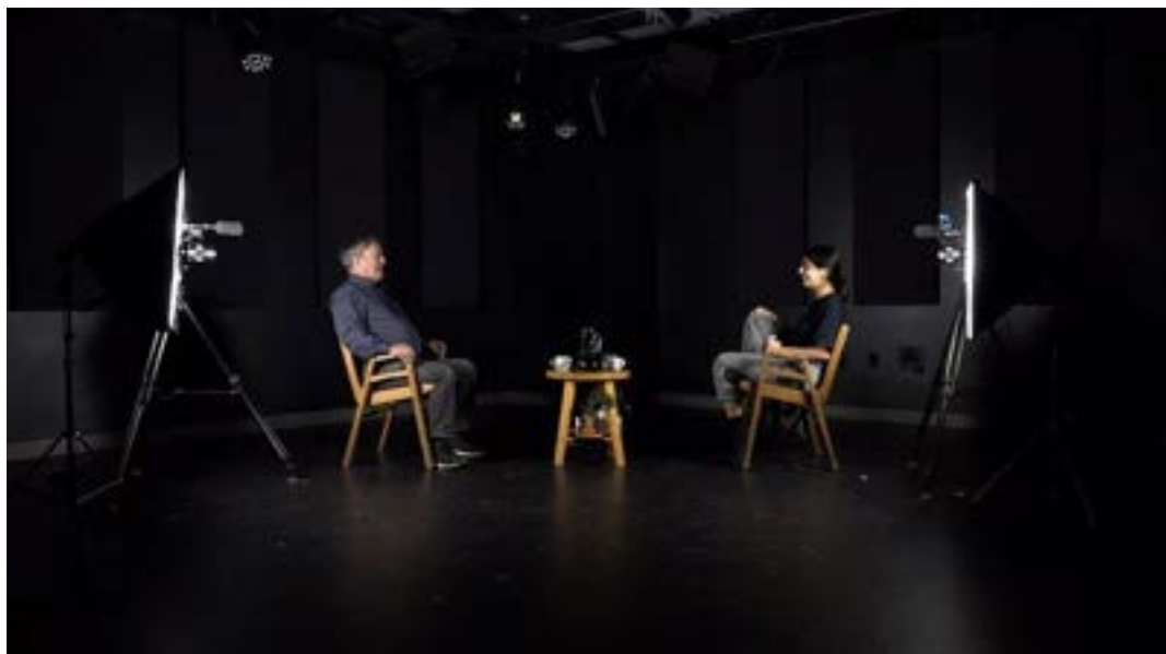
Person in Common (2021) by Veronica Mockler