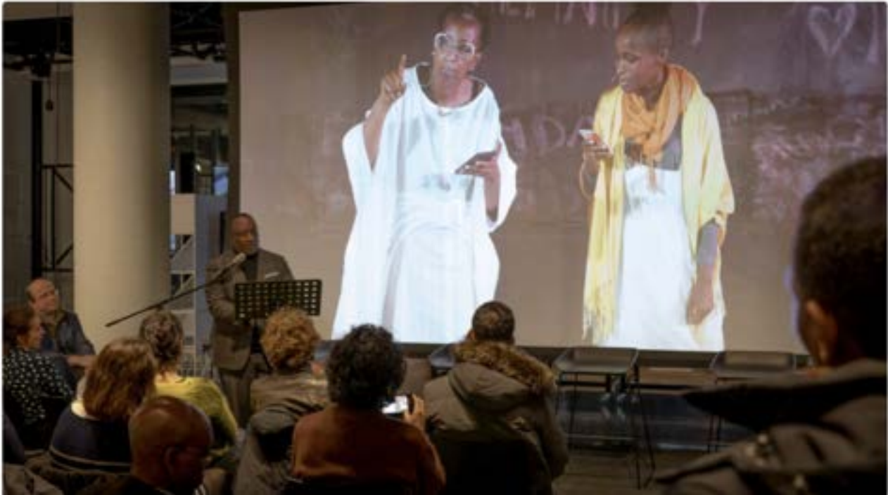
Lancement de la plateforme « Archives vivantes » des exilés rwandais et des survivants du génocide résidant au Canada - Dec 2019.