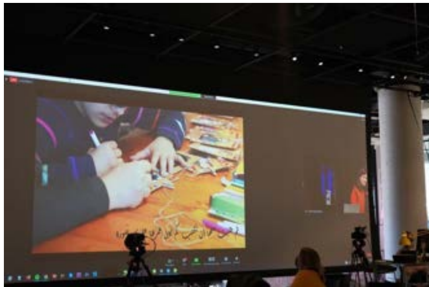
COHDS Emerging Scholars Symposium (2022).