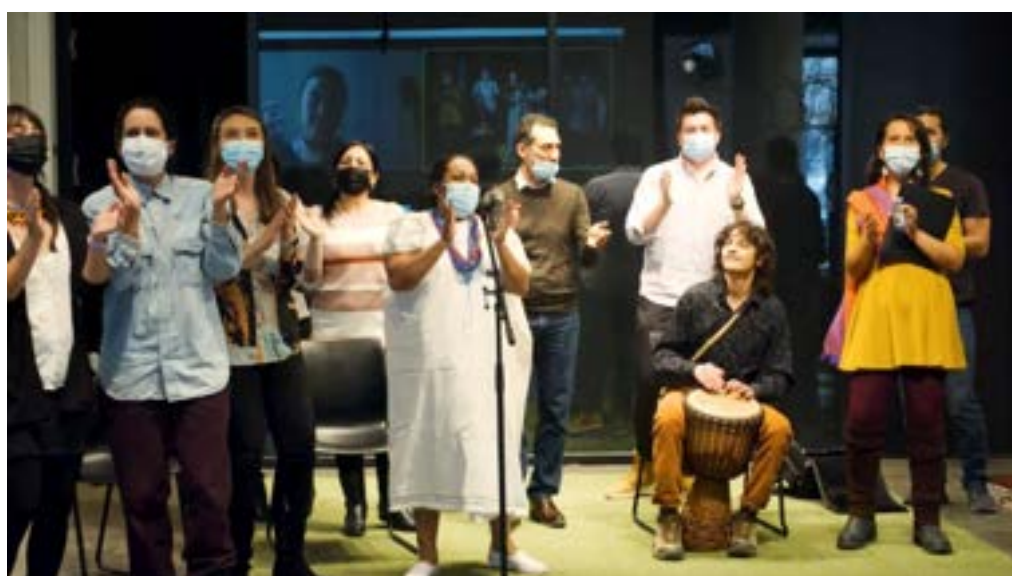
Listening to a Land of Living Memories (2022) organised by the ALLab and 4TH SPACE